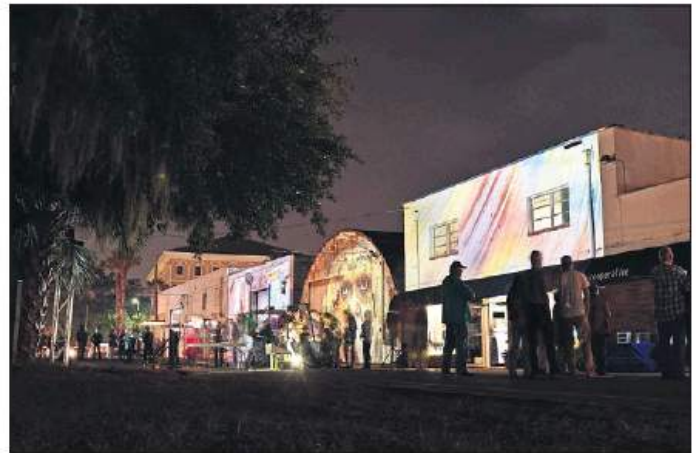
Festival-goers check out the art and activities in downtown Panama City during the 2017 Public Eye Soar.